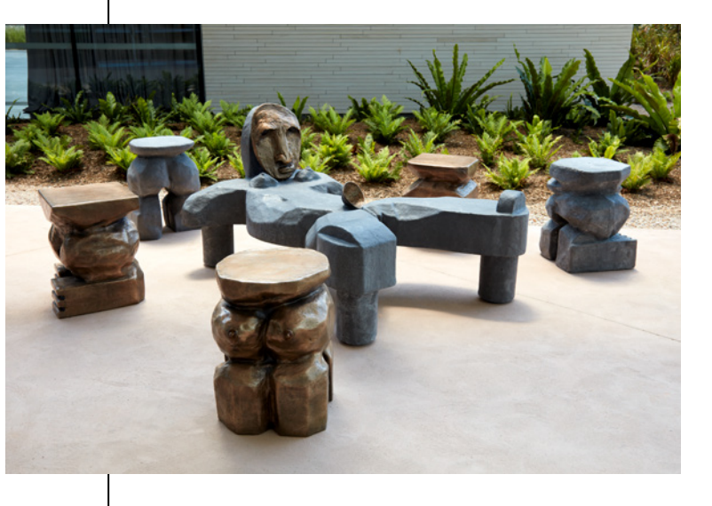
Sanné Mestrom The Offering (Nyotaimori Reclining Nude) 2021, concrete, bronze, 65 x 115 x 170 cm, Art Gallery of New South Wales, purchased with funds provided by The Barbara Tribe Bequest 2022 © Sanné Mestrom

'I'm interested in the female body, all the power that it holds as a mother, which comes from an erotic space. They're these kind of opposing worlds, but the source is the same ...'