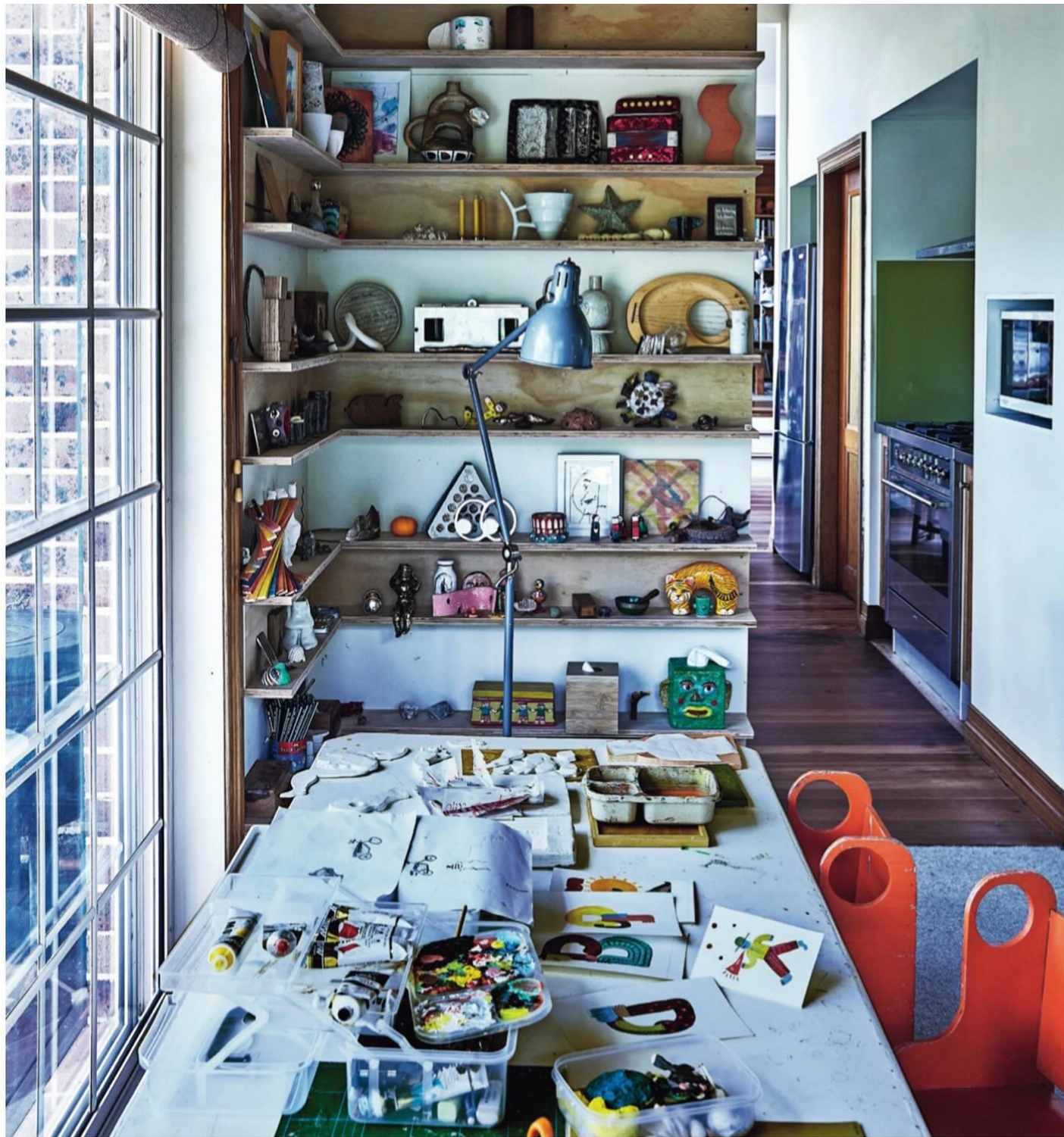
While Mestrom set up her main sculpture studio in a large adjacent garage, she also transformed a large room off the kitchen into a craft room for her son Danté.